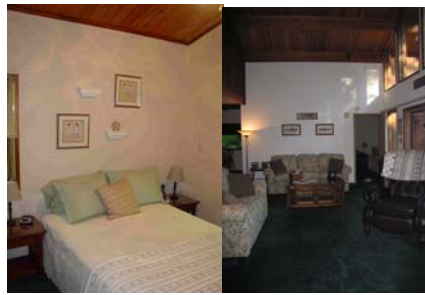
Third Bedroom and Living Room