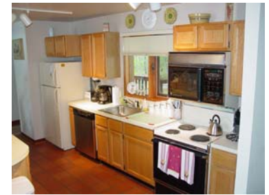
Fully Stocked Kitchen