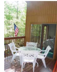
Deck off Living Room and Both Direct