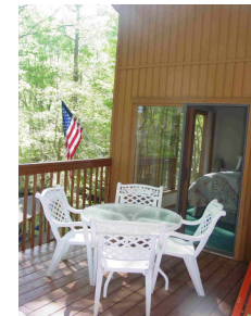
Deck off Living Room and Both Direct