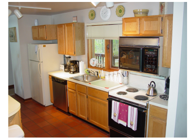
Fully Stocked Kitchen