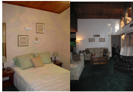
Third Bedroom and Living Room